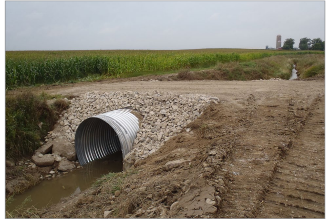
Figure 1. A wider crossing recently installed on a drain.

Remember, the property owner requesting the minor improvement project becomes financially responsible for the project costs as soon as their signed request is accepted by Council.