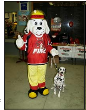
Sparky & Molly made a great team!