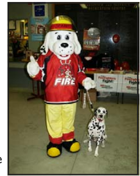
Sparky & Molly made a great team!