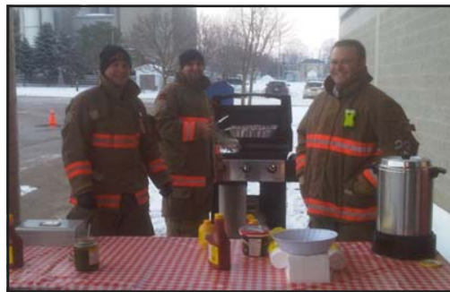
Innerkip Firefighters ran the popular barbeque