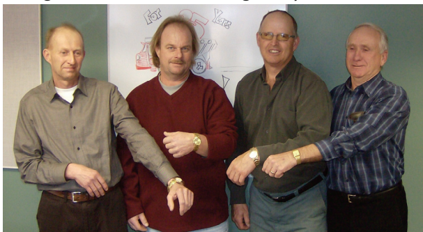
"The 100 year old road crew".....

Collectively, the four equipment operators in the Road Department have 112 years of service with the Township. This is certainly quite an accomplishment.