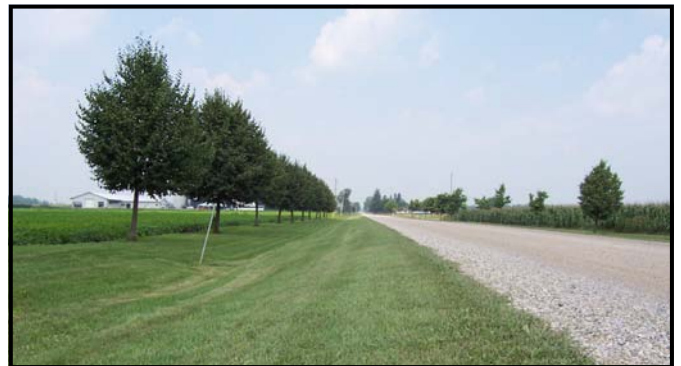
A larger, colour photo is available on the Township's website.

In this edition of EaZy Talk, the photo displays one of many well maintained roadsides in the Township. Where possible, residents will often maintain the roadside along their property. This activity is greatly appreciated by the Township. Maintaining the roadside helps reduce spraying and maintenance costs and keeps the Township looking beautiful. Part of the Township's road program is to improve roadsides to permit easier maintenance activities by the Township and property owners. While the Township greatly appreciates this assistance, please exercise caution when working along a roadside.